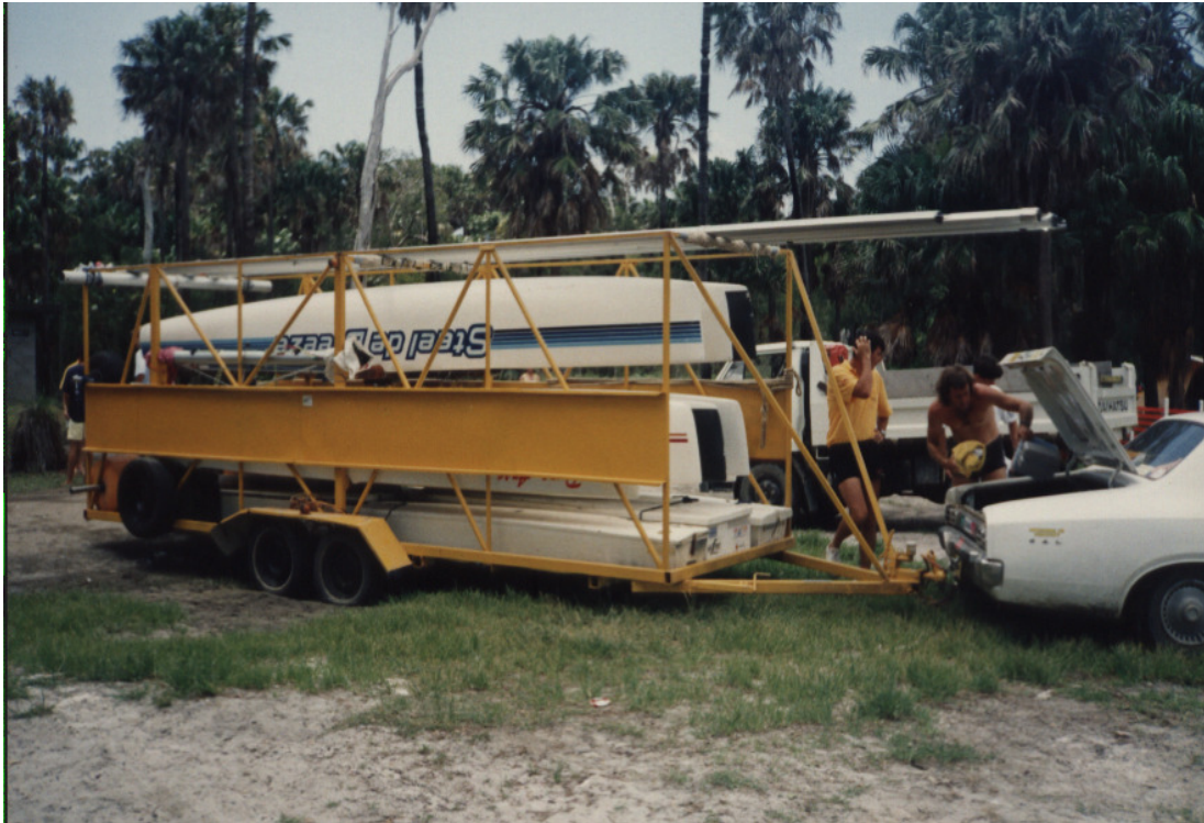
Loaded trailer at Forster

We spend the next 4 days setting up the boats and sailing on the lake. The weather is very poor with rain and thunderstorms rolling in most nights.