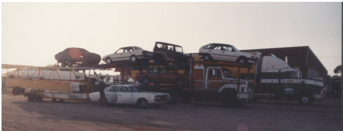
Fuel stop on the Nullarbor

By mid day the eagles have become the next big problem for us. These large, majestic creatures are cleaning up the road kill. As you approach them they mostly just hop of the road and return to there meal as you pass by. But every now and then one will take flight. These birds take minutes to lift of and we narrowly miss several that just clear the car, and come even closer to the masts secured to the top of the trailer.