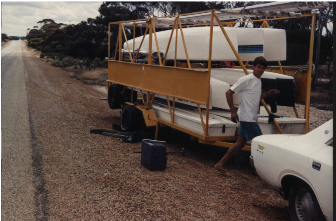
Damaged trailer on Day 1

Well it appears our luck is rapidly running out, as we leave the yard we become bogged in soft sand. We are at the back of an industrial lot on the edge of town, borrowing parts when the owner isn't home, so calling for help didn't seem to be an option. We spend an hour jacking and digging and chocking the tyres before we are free.