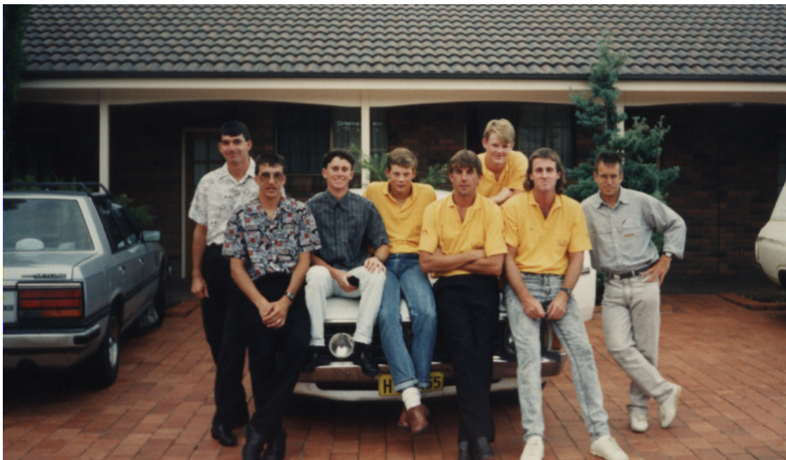
Team WA at Forster. (Sitting on the Valiant)